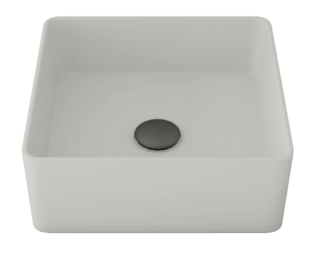
LISO 14 5%"×14 5% h 5 1%"