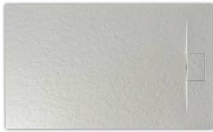
PIZARRA A 35 1/2 - 82 3/4 B 27 1/2 - 47 1/4