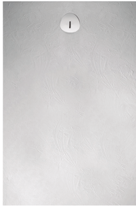
STREET A 35 3/8" - 70 7/8" B 27 1/2" - 39 3/8"