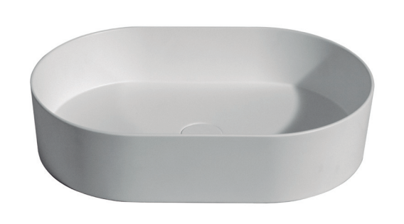
LISO 22"x14 %" h 5 %"