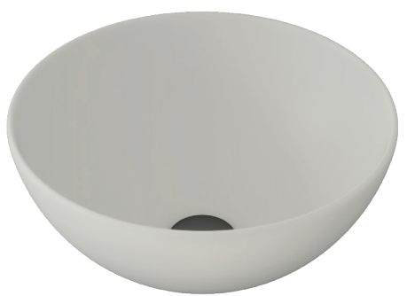
LISO ø 15 <sup>3</sup>⁄4" h 6 <sup>1</sup>⁄4"

Technical specifications are subject to change without notice. Dimensional tolerances +/- 3/16"