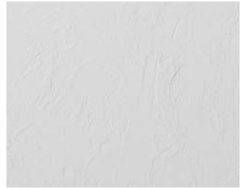
STREET L 400-1000 | H 700-2500